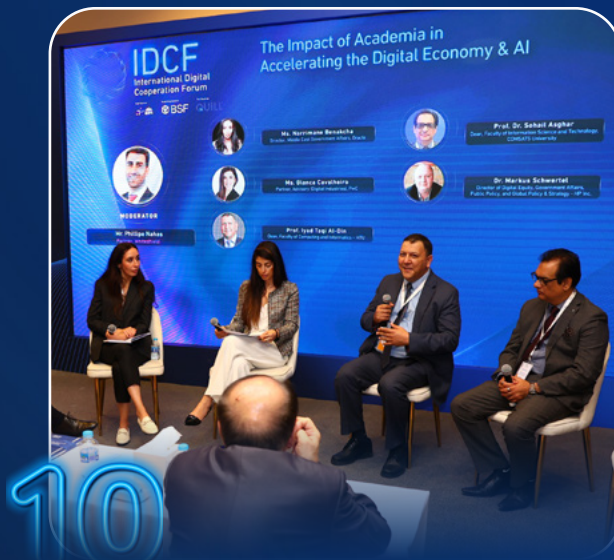
The impact of academia in accelerating the digital economy and Artificial Intelligence