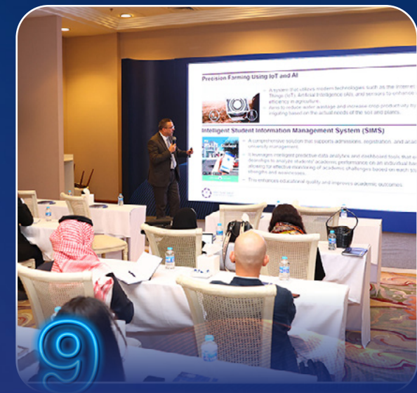
Fireside Chat with the Royal Scientific Society of Jordan