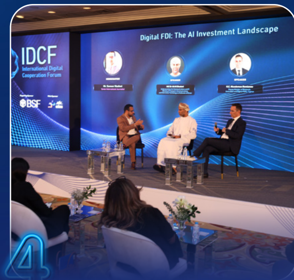
Digital FDI: The AI investment landscape