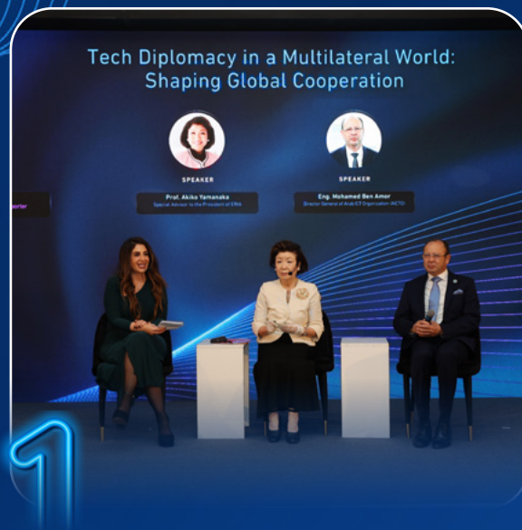
Tech Diplomacy for Digital Prosperity: Shaping Global Digital