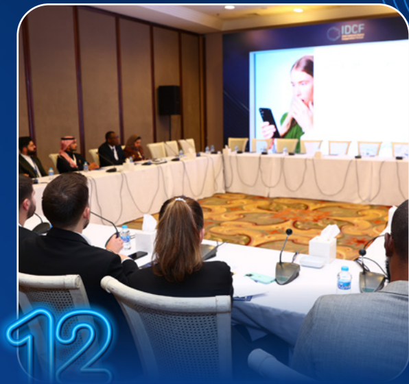
Combating Online Misinformation: A Youth-Led Dialogue