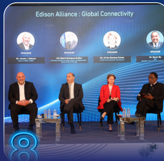
WEF Edison Alliance: Prioritizing Digital Inclusion.