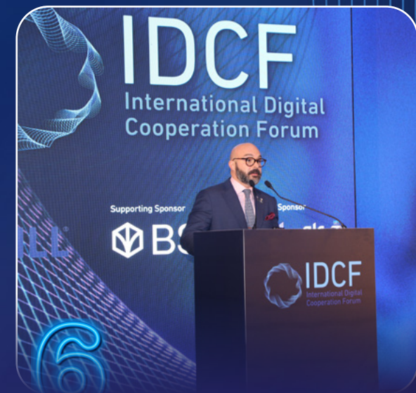
Misk Foundation and Accenture: By Youth, For Youth - AI in Education