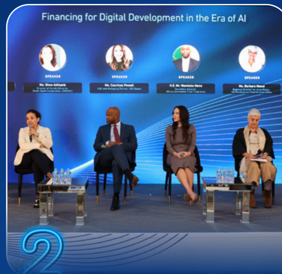
Financing for Digital Development in the Era of AI