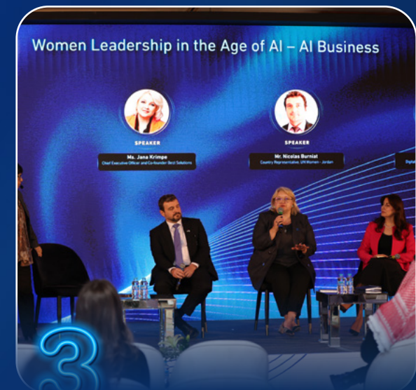
Women Leadership in the Age of AI – AI Business