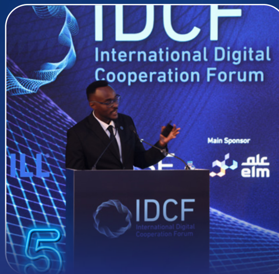
From Theory to Action: Unleashing AI Tools for Tomorrow