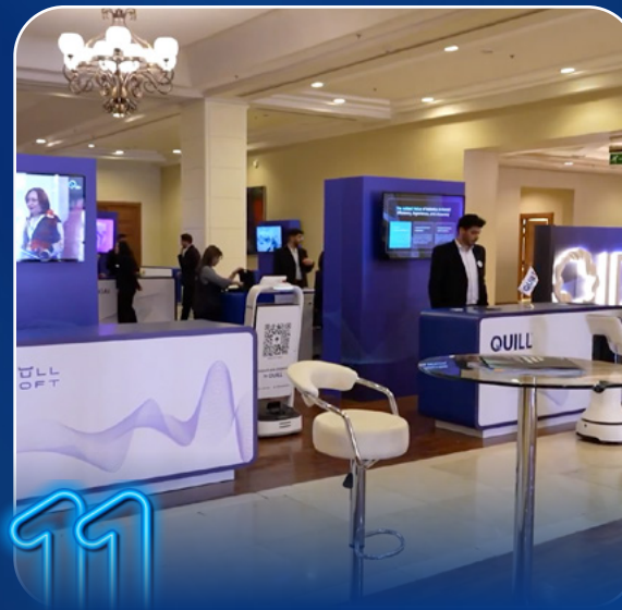
Startups Elevator Pitch on Stage